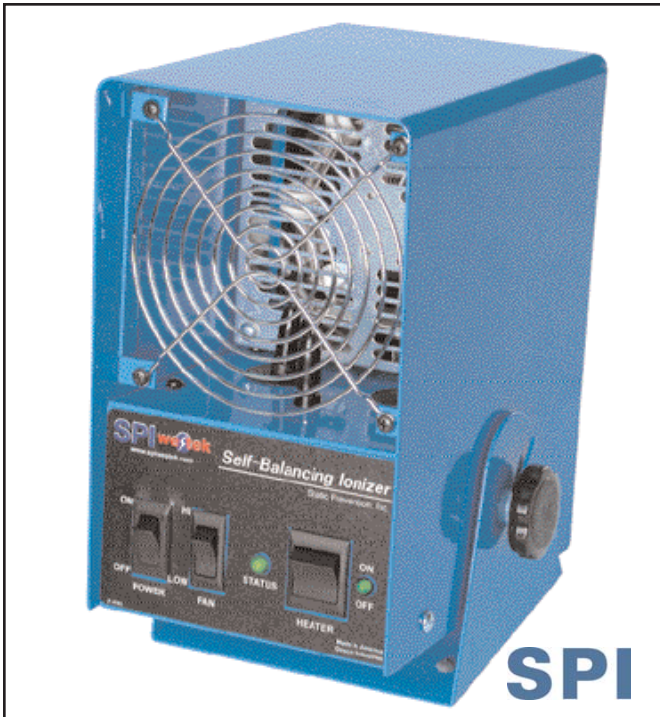
Figure 1. Item 94010, Auto-Ion™ Self-Balancing Ionizer