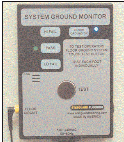
Figure 1. Statguard Flooring System Ground Monitor, Item No. 46100