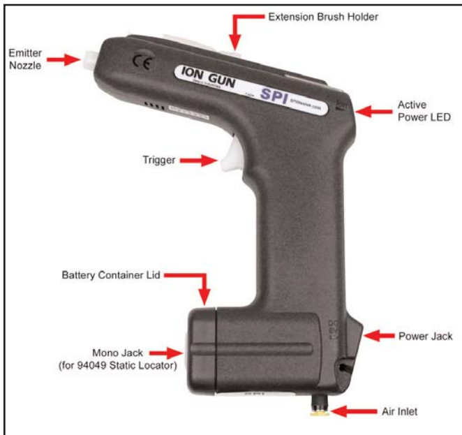
Figure 2. Ionizing Air Gun Features and Components

NOTE: Ensure that the air supply/source is set within the 10 - 65 PSI range.