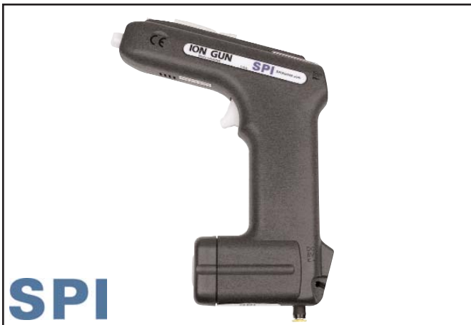
Figure 1. 94100 Ionizing Air Gun